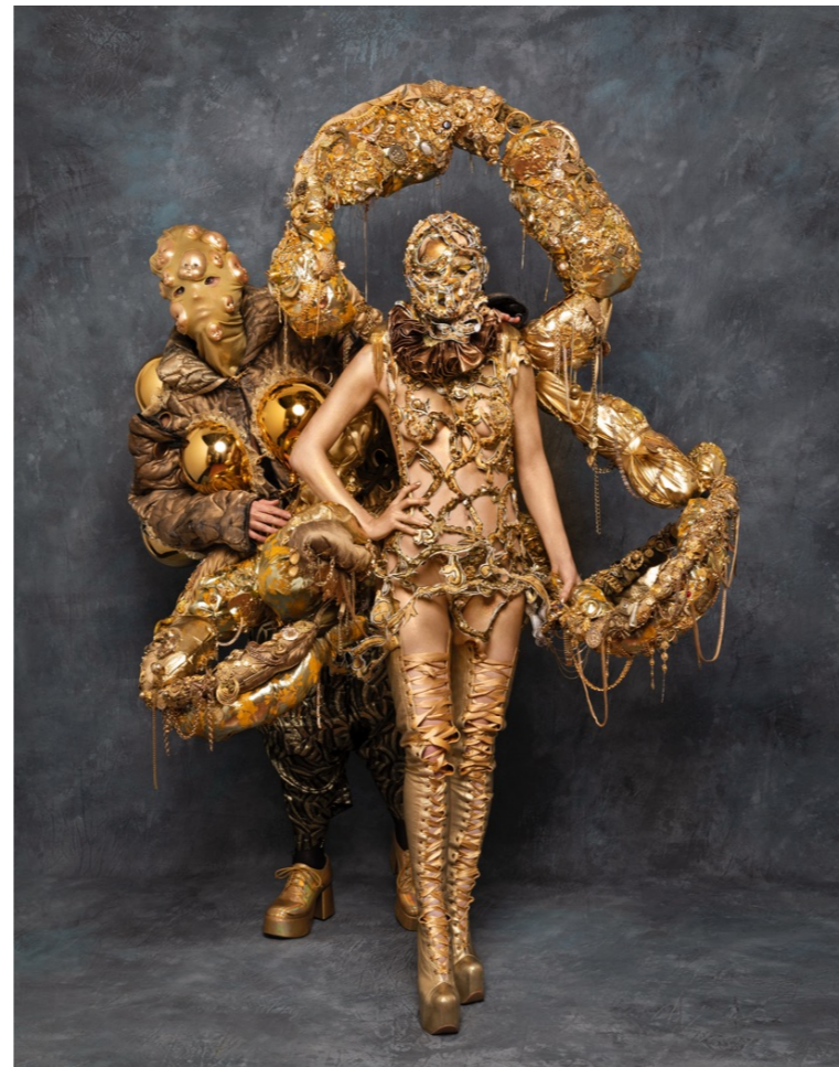
Shakespeare's Globe 2022