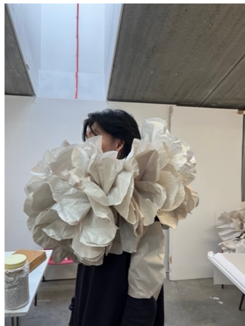
Exploring paper as material for the beauty of its fragility and to integrate a performative dimension