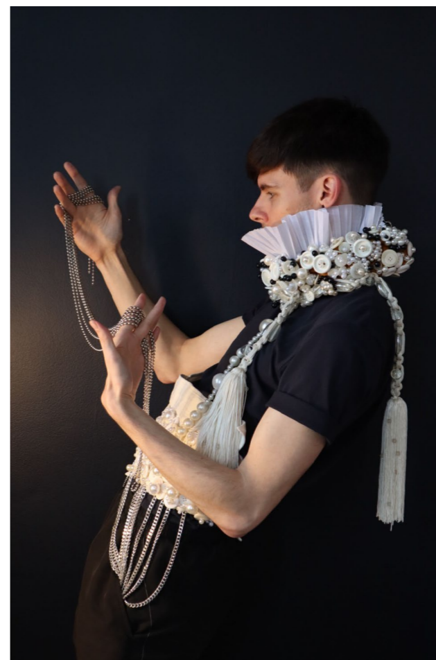
Coat embroidered with beads, silk pearls and ribbon Glove Embroidered with natural stones and beads