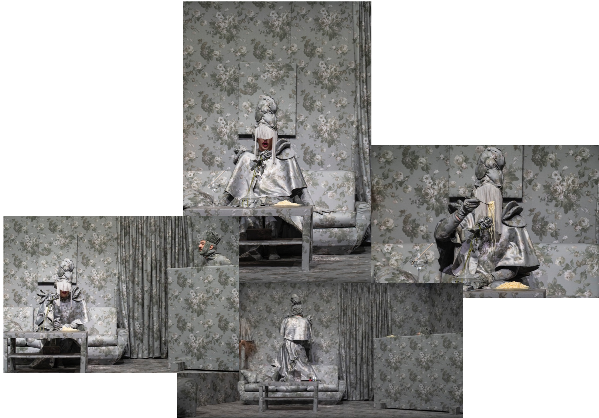
Genderless costumes for a drag-baritone and a pianist